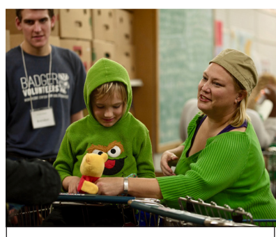
The River serves over 650 households every week with groceries, clothing and hot meals.

There are many reasons why a person walks through The River's door. Many need that little assistance of