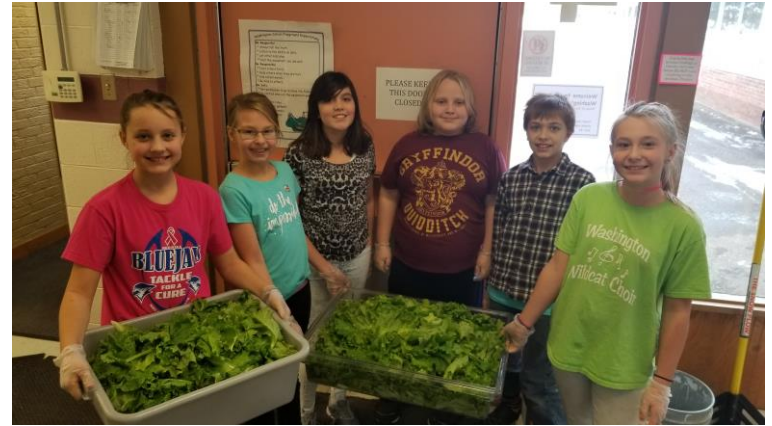
Washington Elementary, Merrill, WI